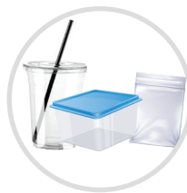
Plastic Containers, Straws, Cups, Ziplock Bags