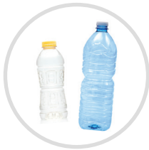
Soft Drink Bottles, Mineral Water Bottles