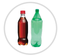
Bottles with Liquid or Food Residue