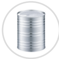
Milk Powder Tins