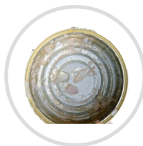
Cans with Food Remnants