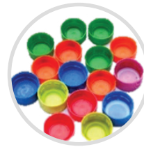
Bottle Caps Do not need to be segregated