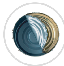
Cans with Sharp Edges