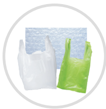
Plastic Bags, Films