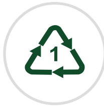
Bottles with PET Symbol